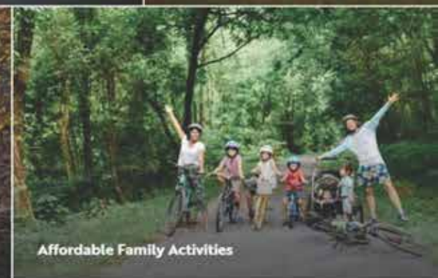
Affordable Family Activities