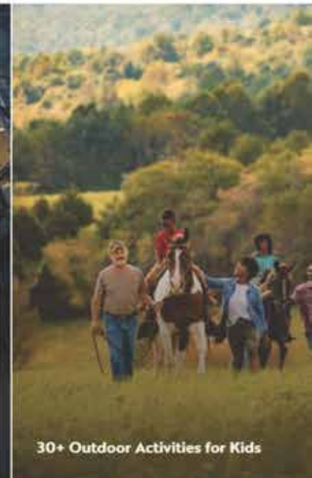
30+ Outdoor Activities for Kids