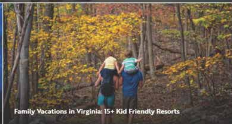
Family Vacations in Virginia: 15+ Kid Friendly Resorts