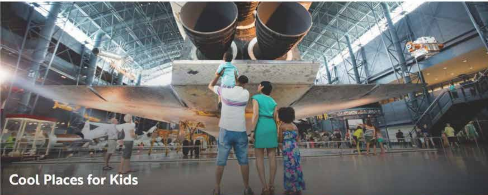
Cool Places for Kids