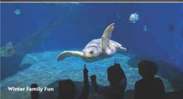
Winter Family Fun