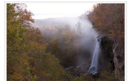
Falling Spring, Allegheny County

2. Speaking of waterfalls, a three-mile hike along Crabtree Falls Trail will lead you to the highest vertical-drop cascading waterfall east of the Mississippi – 1,200 feet by way of five major cascades and several smaller ones. It's a site that's worth the hike in Nelson County.